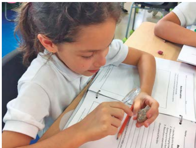
▲ 4A student observing sedimentary rocks

In Social Studies, all teachers are creating engaging units aligned to the National C3 Framework and in Science, 2nd and 4th grade students are piloting a new curriculum designed around inquiry, called Amplify.