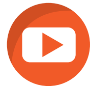
Media Statistics and data in general

Go way beyond being active in Social Media. They include the understanding of facts